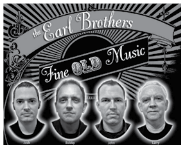
The Earl Brothers Grey Sky Boys

This intergenerational festival features music from old-time, bluegrass, and regional string band traditions to ensure that traditional folk and country musical styles continue as a living, vibrant form of musical expression from one generation to the next.