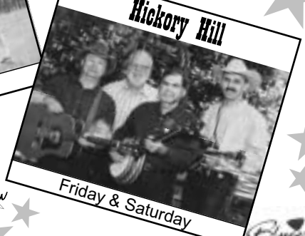
Friday & Saturday