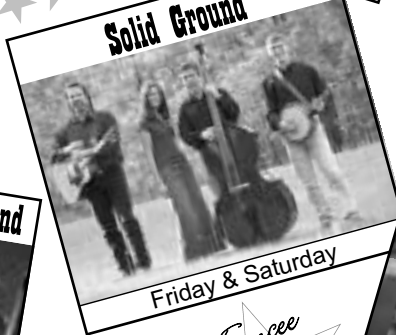
Friday & Saturday