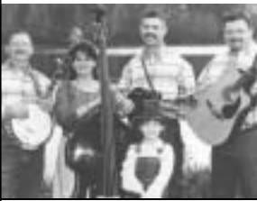
Friday & Saturday