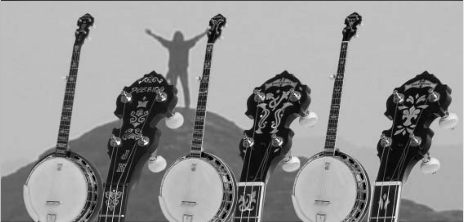
Krüger Banjo $7,999