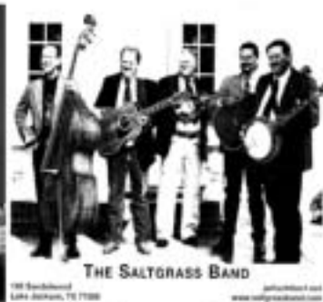
The Saltgrass Bands