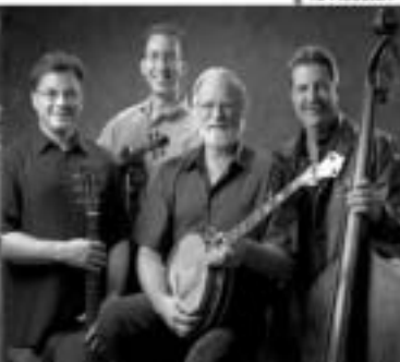
Lonestar Bluegrass Band