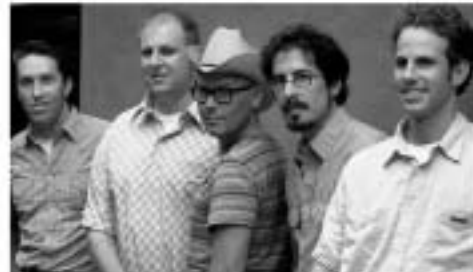
Grassy Knoll Boys