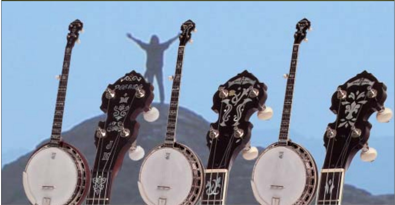
Krüger Banjo $7,999