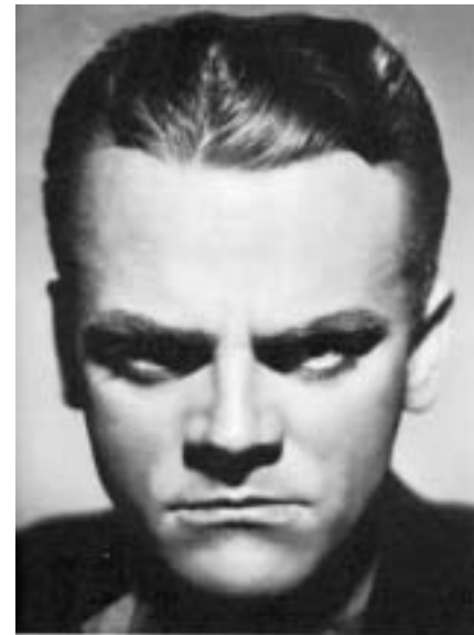
the common “bully”

I got my long razor, gonna carve him deep When I see that bully, I'll lay him down to sleep I'm lookin' for that bully, he must be found