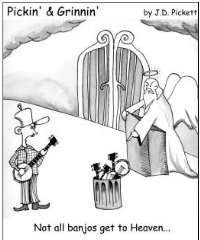
Not all banjos get to Heaven...