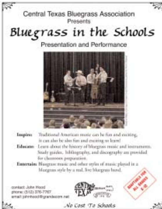
CTBA's flyer for Bluegrass in the School