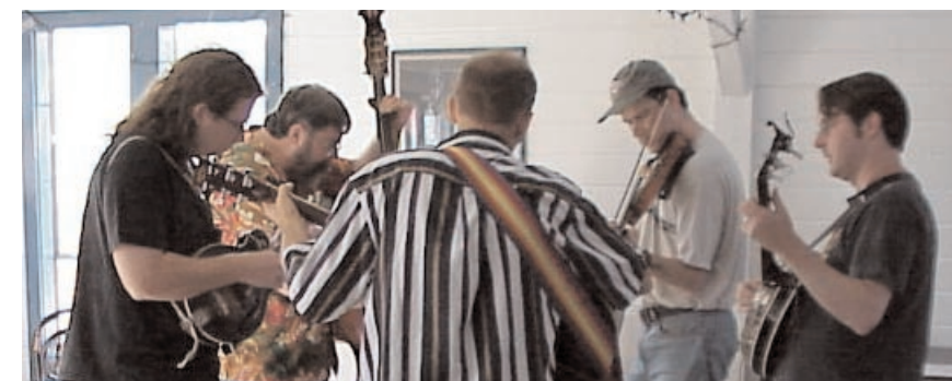
One of the bands honing their stuff before the big show.

We really NEED YOUR SUPPORT... So go clean out that old closet with gently used cd's, instruction books, or anything pertaining to music or BLUEGRASS. Remember if you donate a "large ticket" item it can be written off on your taxes next year.